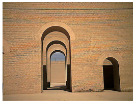
(King N. Palace Courtyard, Babylon, Iraq- 0110) Common folks gathered here. Saddam Hussein rebuilt walls upon original brick.

Our story (from Daniel 3) begins when King Nebuchadnezzar made a gold statue, an image of himself that stood ninety feet tall and nine feet wide. He set it up on the plain of Dura (about 27km SW of Bagdad) in the province of Babylon. (v1)